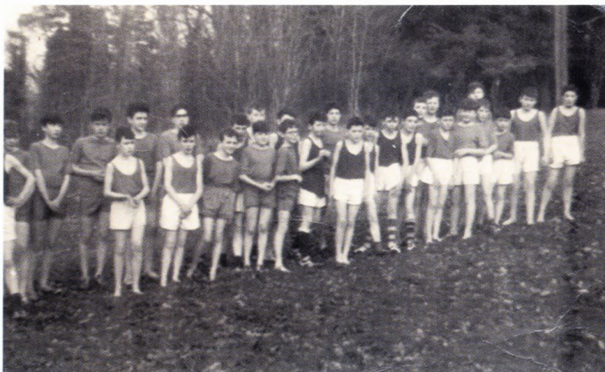
St Patricks College, Cavan: St Felim's (white shorts) and St. Pat's Junior Cross Country teams line up before the start of the race, February 1967.