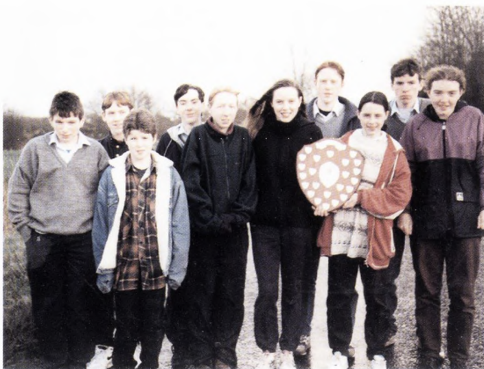
7: Entire school team at the Connacht Schools Cross Country Championships in Ballina 1995.