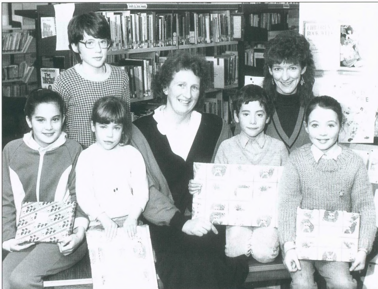
Presentation of Prizes at Children's Book Week in Carrick on Shannon Branch: