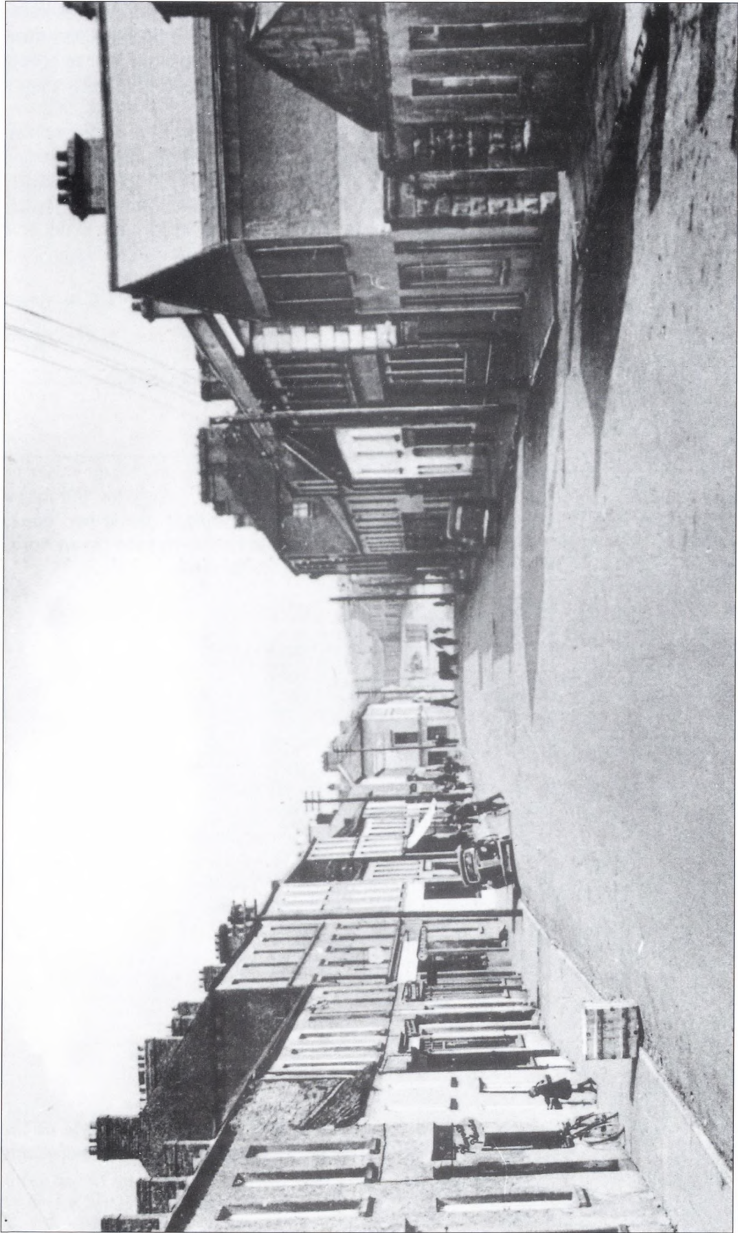
Ballinamore in the 1930s from the railway gates at the bottom of the town.