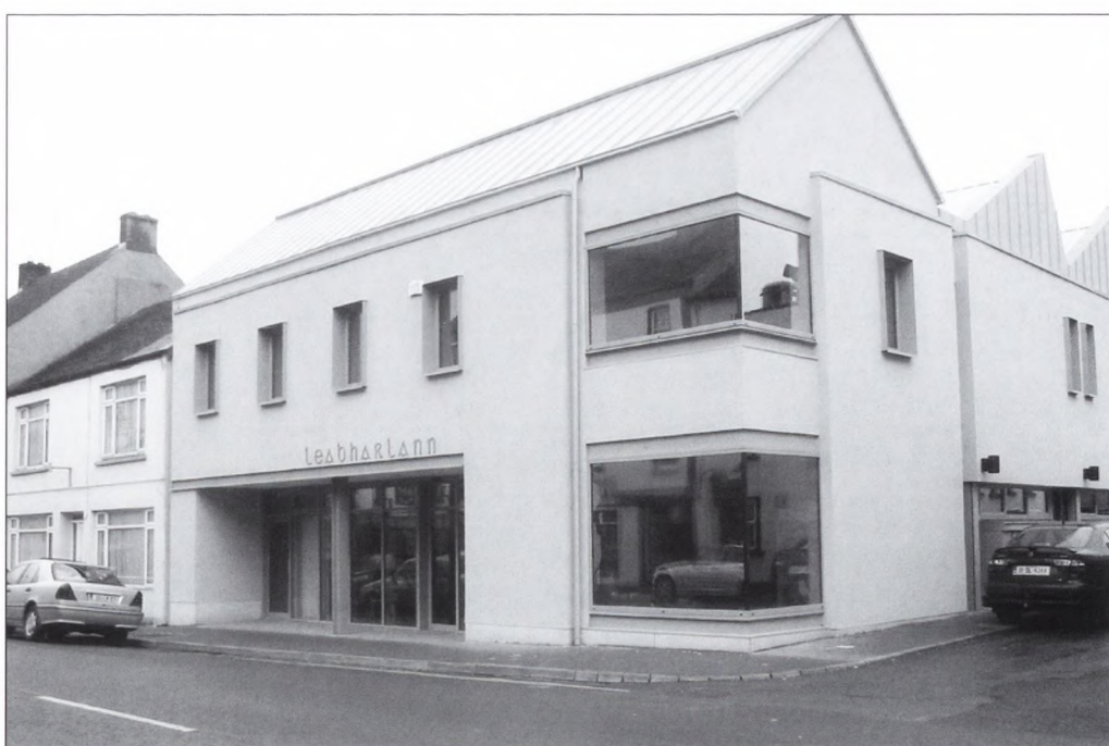
New County Library Headquarters & Ballinamore Branch Library.