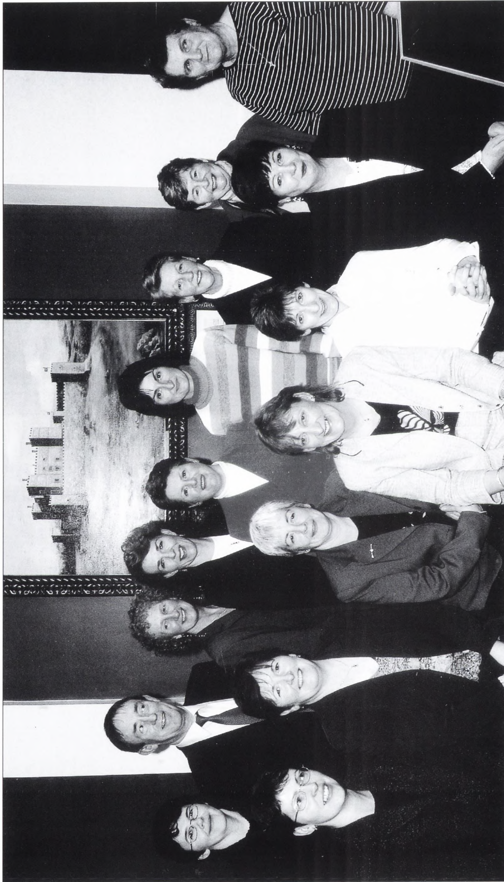
Manorhamilton Library opened on 7 March 2005. This picture shows library staff from libraries throughout Leitrim.